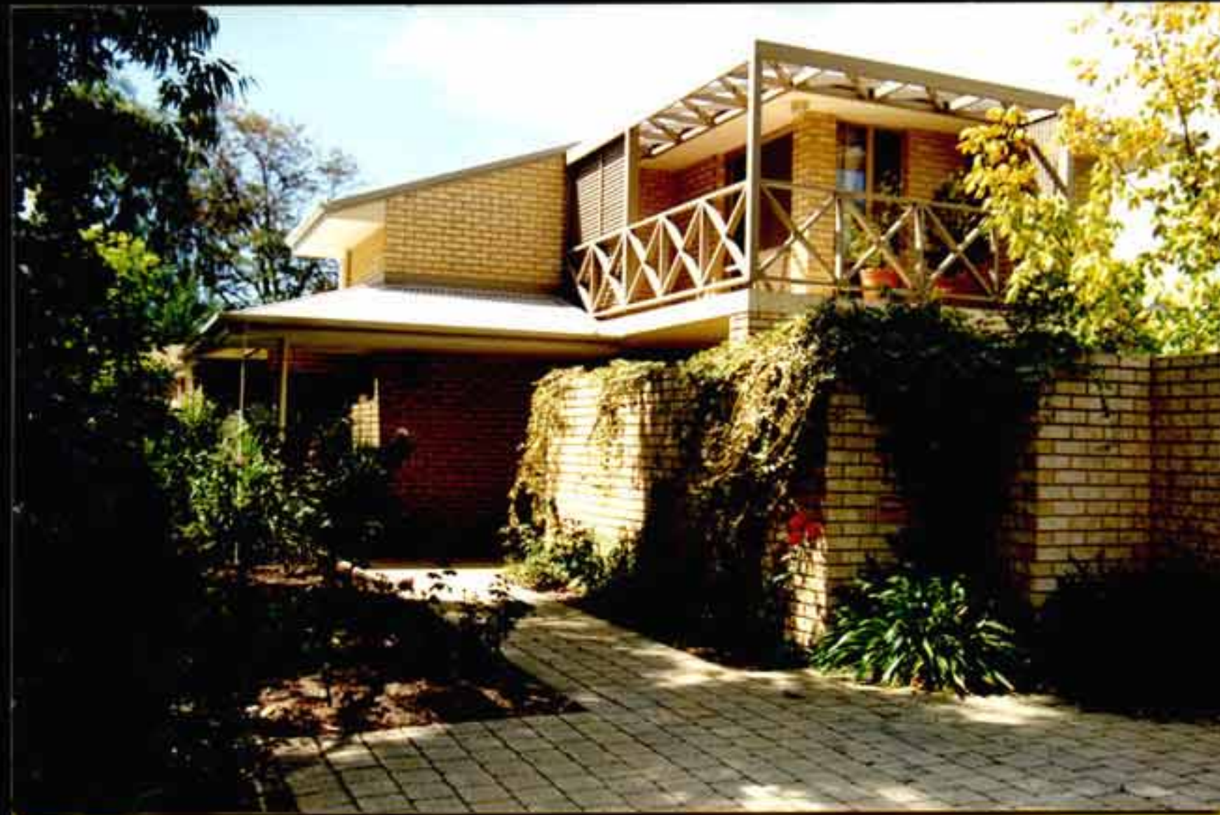
"A Home For All Seasons" 12 Halesworth Road, Jolimont