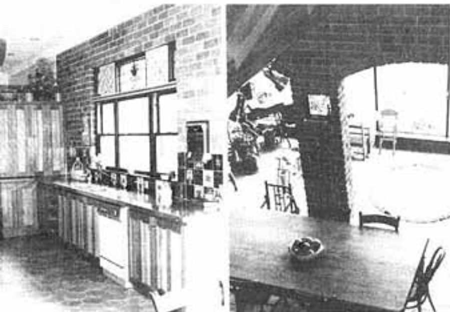
These pictures show the qualities of the magnificent award-winning Glen Forrest Home. The eclipse pergola (top) across the north side of the house allows winter sun into the house. Centre: the delightful solarium. Above: Warm bricks and cedar planking are features of the kitchen (left) and the 'loft' is created mezzanine-style (right).

Unfortunately it is not open for inspection.