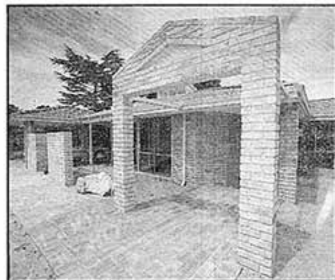
A brick gateway with gable top provides a dramatic entry.