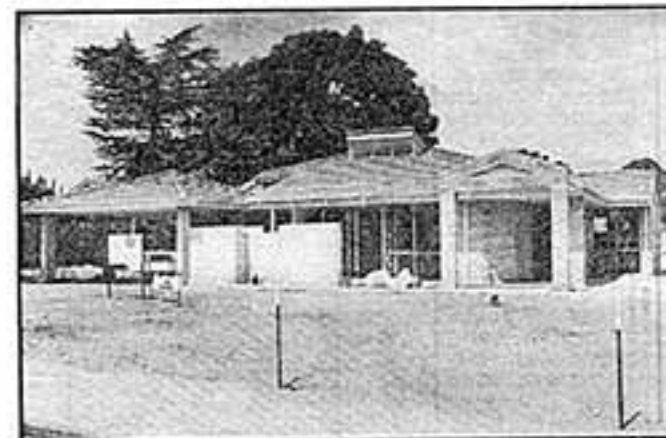
North facing windows in the solar home will enable winter