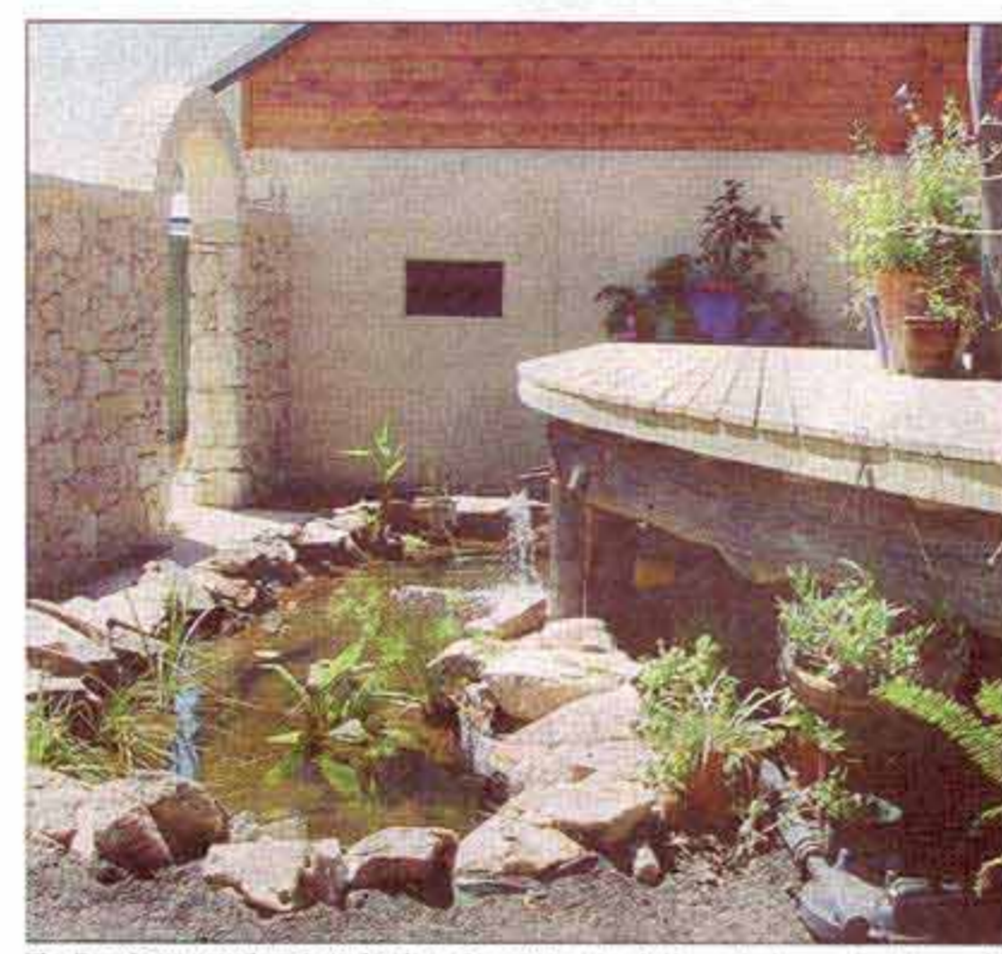
The Eco-Compound project displays GreenSmart solutions that are effective and appropriate for its Cottesloe site.

This year's GreenSmart Awards demonstrate WA's depth of talent in environmentally sensitive design and construction. The winners show commitment, innovation and aesthetic appeal in their projects, which offer practical solutions to a sustainable future.