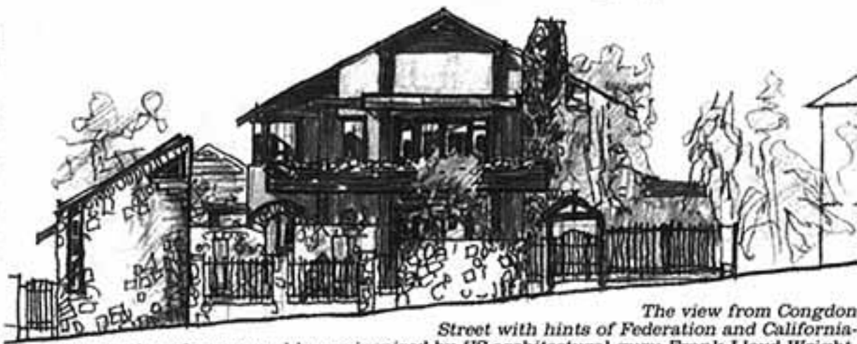
The view from Congdon Street with hints of Federation and California. Bungalow in the solar-powered house inspired by US architectural guru Frank Lloyd Wright.

"This is the approach that should be considered by the state and federal governments to help people stay in the areas they know and love."